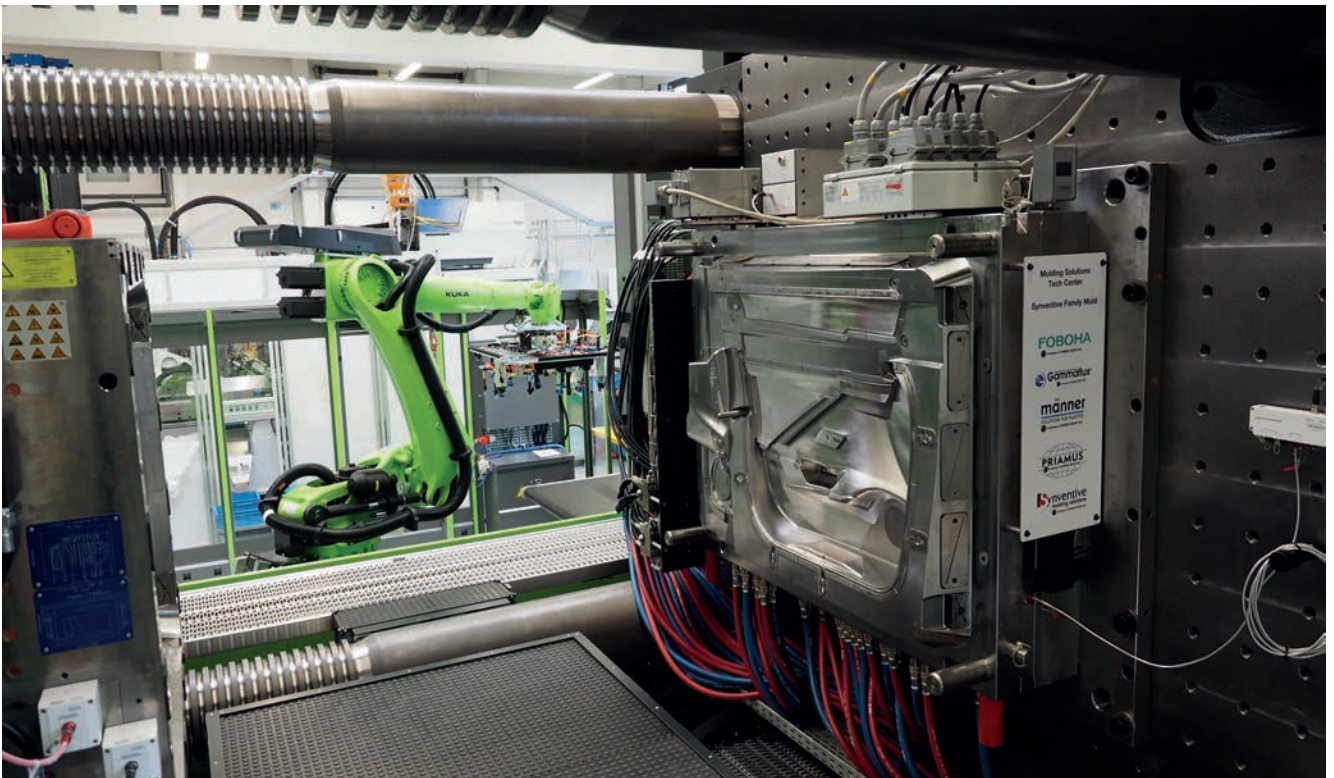
View into the mold space of the Engel Duo 2700 at the Tech Center. In the background, a 6-axis robot with 180 kg load-bearing capacity which removes the components.

Family molds belong to the state-of-the-art in injection molding – at least when wall thicknesses and volumes of individual components vary considerably. Using a trial mold soon ready for series production, Synventive demonstrates that – though demanding – optimal process control can be achieved using the right technology. The filling of each mold cavity is controlled individually and in real time. The Kunststoffe editorial team were among the first guests at the new Tech Center.