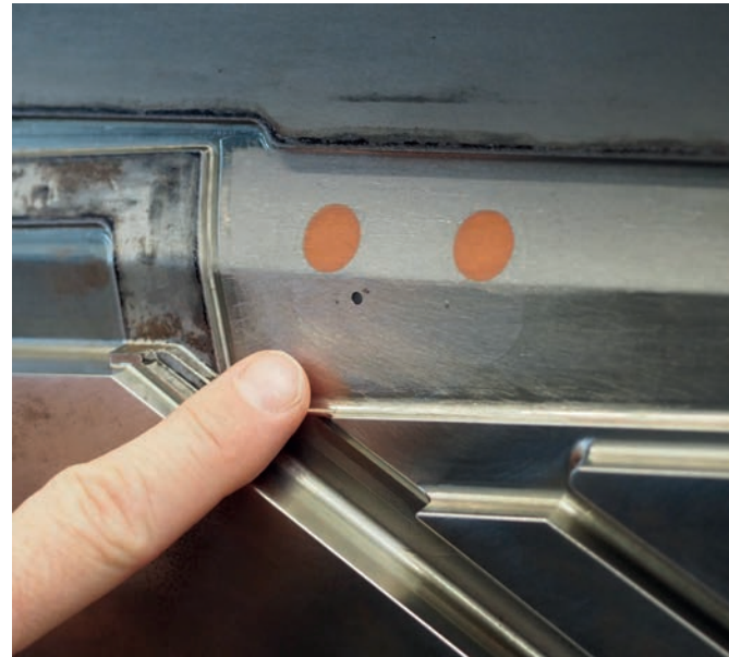
Fig. 4. Making a clear difference: one of 19 sensors installed in the mold.

The trial and development tool offers a whole range of possible applications, including: